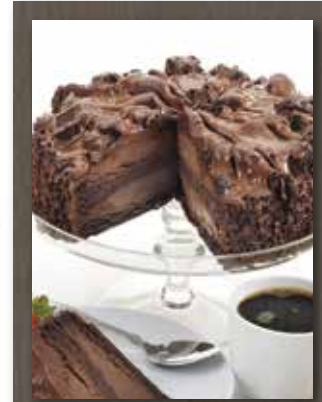
— Chocolate Lovin' Spooncake —

An assortment of cookies and brownies. Serves 12-14 • $25.99