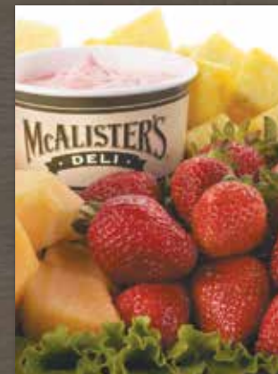
— Fresh Fruit Tray —

An assortment of pastries and muffins. (serves 8-10) • $39.99