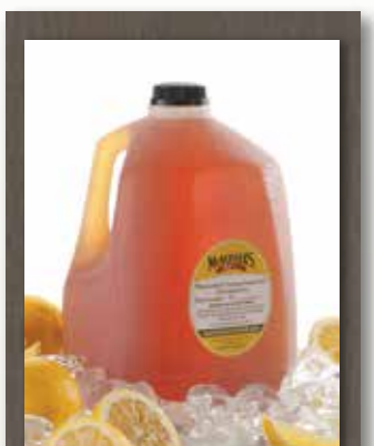
Gallon of McAlister's Famous Sweet Tea™

Includes cups and lids. Serves 7-8. • $9.99