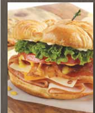
Turkey Club Croissant

Choose from one of our signature wraps: Chicken Caesar, Turkey Bacon Ranch, Veggie or Southwest Chicken • $8.99 per person