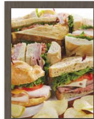
— Traditional Sandwich Tray —

We offer a variety of our premium, delicious sandwiches on our trays that will be sure to please any crowd.