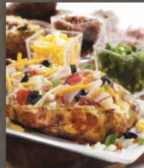
— Spud Max™ Bar —

We start with fresh baked potatoes and then we spread out the fixings! Everybody makes their own masterpiece. A signature McAlister's favorite, a signature success for your event!