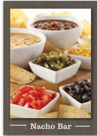
— Nacho Bar —

Regular • $4.49 per person Giant • $8.29 per person