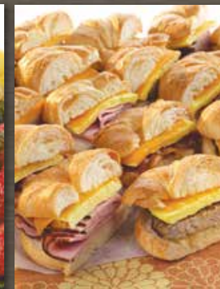
— Croissant Tray —