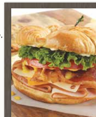
Turkey Club Croissant

Choose from one of our signature wraps: Chicken Caesar, Turkey Bacon Ranch, Veggie or Southwest Chicken • $8.49