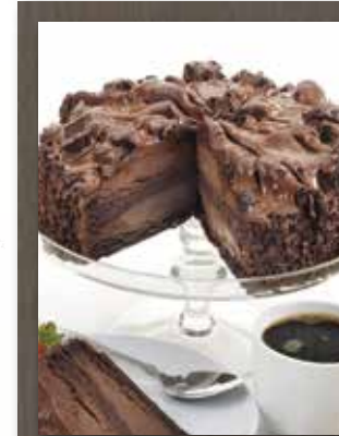
— Chocolate Lovin' Spooncake —

An assortment of cookies and brownies. Serves 12-14 • $20.99