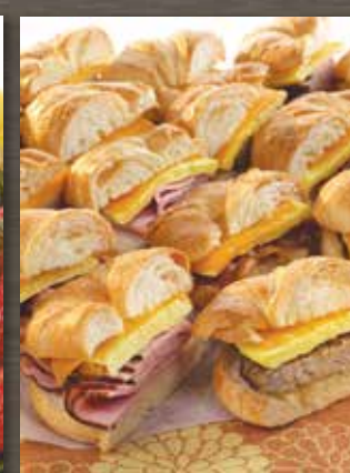
— Croissant Tray —