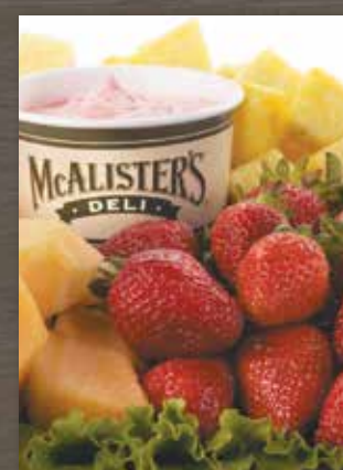
— Fresh Fruit Tray —

An assortment of pastries and muffins. (serves 8-10) • $39.99